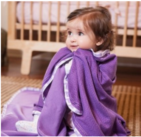
Baby blanket – $52.00

I think we should all stop and have a moment to appreciate how cute this kid is..... and back to the blankie. I was just floored by the selection of colour from Petites Frites blankets. You can pick up one of their 50" x 50" blankies from an astonishing choice of 14 different colours! There is truly something for everyone's personal taste. Coloured with low-impact, baby-friendly dyes and machine washable (and dryable) these gentle giants fold down smaller than a yoga mat and can be tucked under a crib or toddler mattress for storage. I know it says on the site that they're for children but props to their model because she makes that blanket look so cosy that I want one for myself!