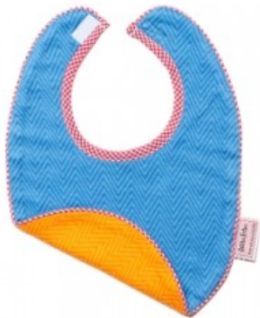
Reversible bib – $11.00

In the run up to Ireland's Pregnancy & Baby Fair this weekend in the RDS, Dublin, I'll be reviewing some adorable and essential baby products. A mother of one I absolutely adore Petites Frites' bold and bright range of baby accessories. If you've ever had to go baby shopping you'll know yourself most baby items are limited to blues and pinks (boring) but Petites Frites has a colour coated collection that will knock your socks off! From ultra violet purples to sunny side up orange they have everything to create a vivid and enchanting environment for your baby. Here's a couple of my favourite pieces: