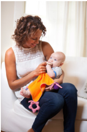
Teether Blankies – $32.00

I think we should all stop and have a moment to appreciate how cute this kid is..... and back to the blankie. I was just floored by the selection of colour from Petites Frites blankets. You can pick up one of their 50" x 50" blankies from an astonishing choice of 14 different colours! There is truly something for everyone's personal taste. Coloured with low-impact, baby-friendly dyes and machine washable (and dryable) these gentle giants fold down smaller than a yoga mat and can be tucked under a crib or toddler mattress for storage. I know it says on the site that they're for children but props to their model because she makes that blanket look so cosy that I want one for myself!